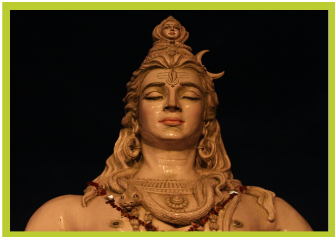
Maha Shivaratri - Tuesday, February 17